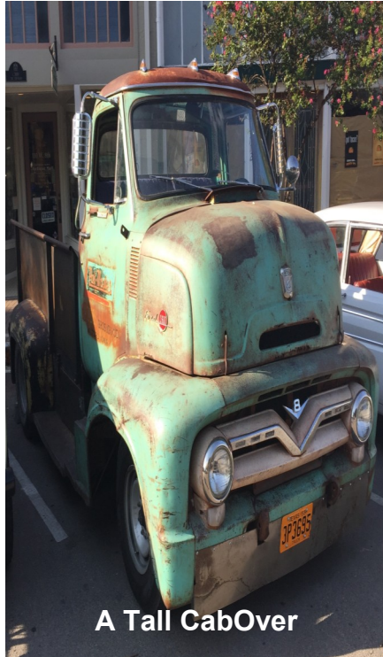
A Tall CabOver