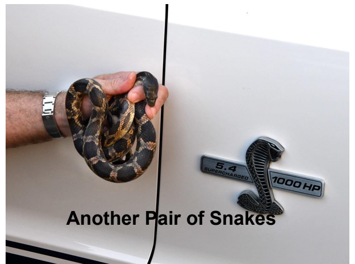
Another Pair of Snakes