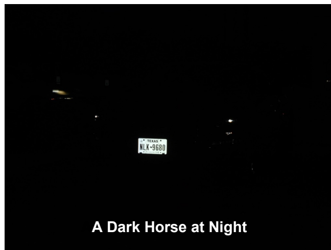
A Dark Horse at Night