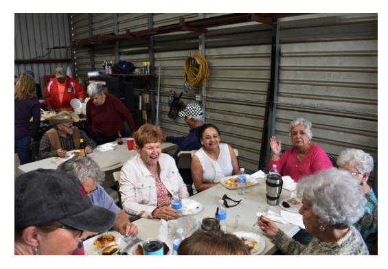
Hail to the Chef!!!