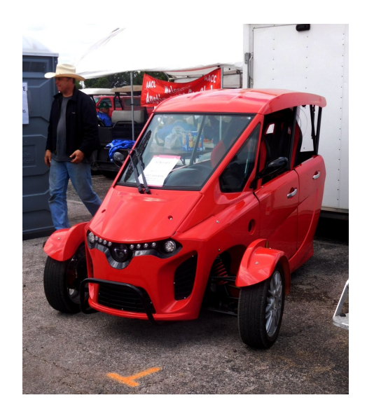
Rated for the Road @ 50mph Charge it up and go____