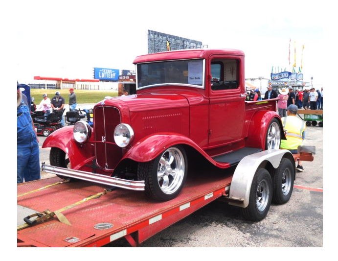
Yours for a mere $75K (Trailer Included?)