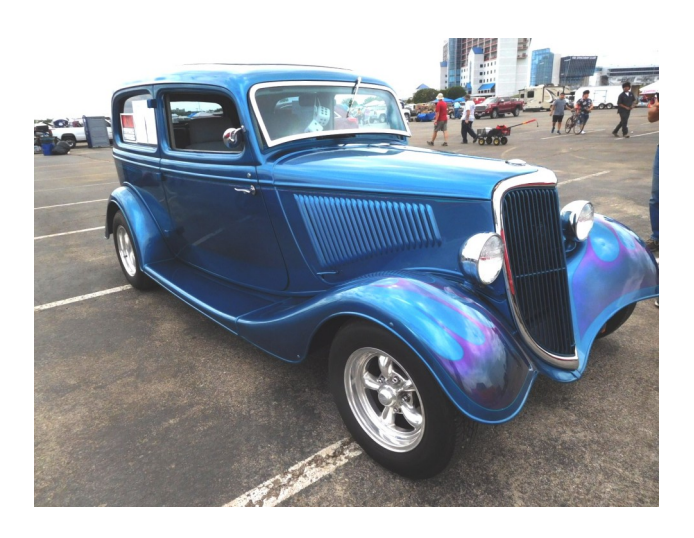
Yours for a more reasonable price